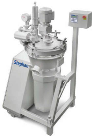
Model STEPHAN UMSK 24 (possibly with optional accessories)